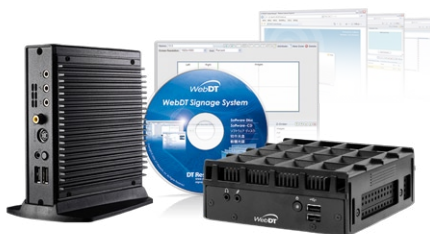
WebDT SA1000 and SA3000

The digital signs are managed with the WebDT Content Manager (WCM) software, enabling Specialty's to efficiently navigate the layout design and scheduling of their menus and consumer communication. The WCM software provides an intuitive tool to the marketing department, enabling the creation of a dynamic screen layout with up to 8 zones of different content for a single screen. WCM also allows scheduling power timing, so screens can be turned on and off at specific times, and scheduled downloading to use off-peak hours for content playlist updates.