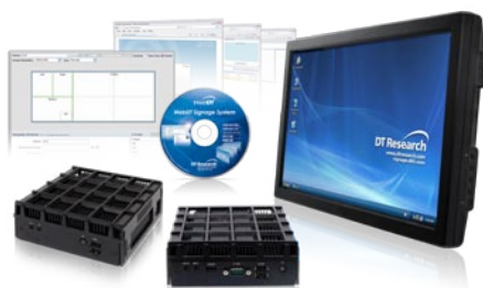
DT Research SA3000, SA3200, IR22 and WebDT Content Manager

The SA3200 and SA3000 are also paired with Mitsubishi LCD monitors (42" to 52") and wireless keyboards in the conference rooms and education labs used for classes and staff meetings.